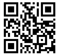
RENEW RESOURCES iarbc.org/renew-2020/

PLEASE SEE THE YELLOW INSERT FOR MAIN SESSION SEATING (CHAPEL & LIVESTREAM)